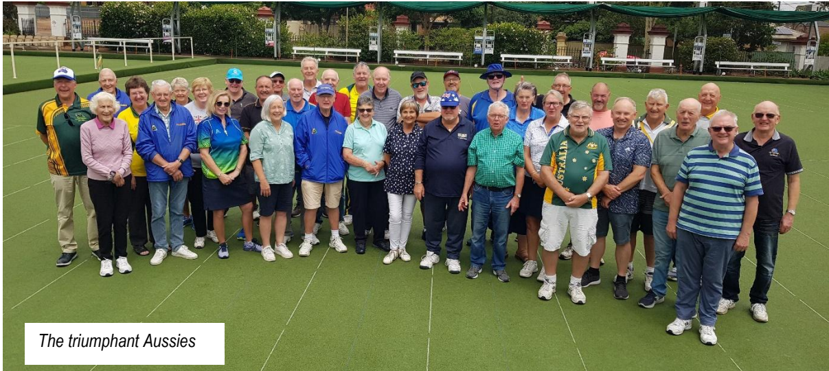
The triumphant Aussies

The annual Australia v Rest-of-the-World Challenge this year attracted 65 players, fifty men and a record 15 women.