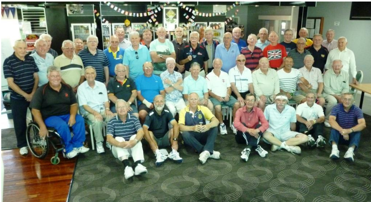
The fabulous and glorious team representing the Rest-of-the-World

♪♪ Zicke, zacke, zicke, zacke Hoi, hoi, hoi Zicke, zacke, zicke, zacke Hoi, hoi, hoi Aussie, Aussie, Aussie Phoi, phoi, phoi. ♪♪