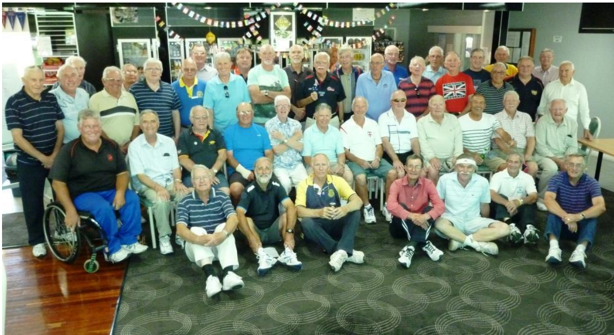
The fabulous and glorious team representing the Rest-of-the-World

♪♪ Zicke, zacke, zicke, zacke Hoi, hoi, hoi Zicke, zacke, zicke, zacke Hoi, hoi, hoi Aussie, Aussie, Aussie Phoi, phoi, phoi. ♪♪