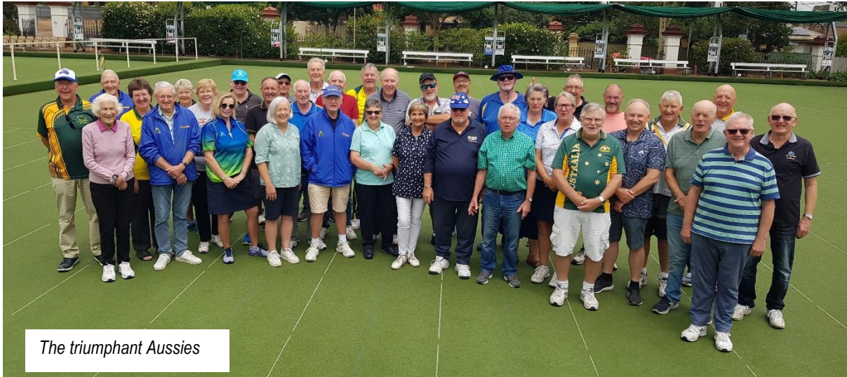
The triumphant Aussies

The annual Australia v Rest-of-the-World Challenge this year attracted 65 players, fifty men and a record 15 women.